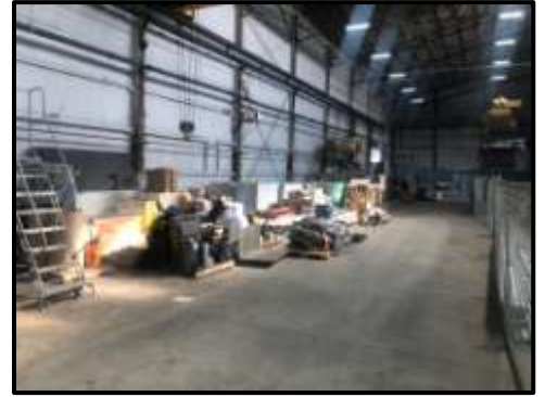
Bright Insulated Space