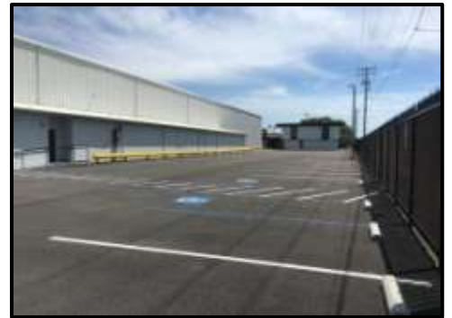
Secure Parking & Loading