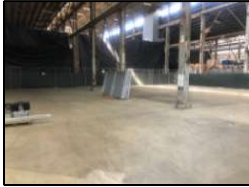
Wide Open w/ 30' to 45' Clear Ht.